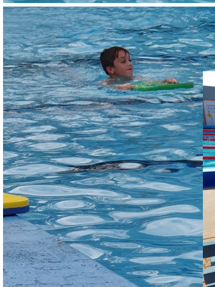
Rainbow & Hopetoun Pools